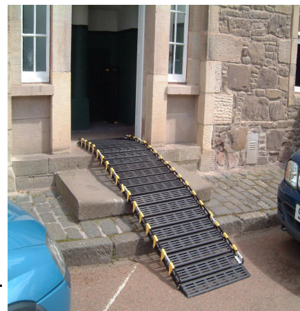
Roll-a-ramp at the Millworkers House

If you wish to visit these areas please ask the staff on duty for advice & assistance.